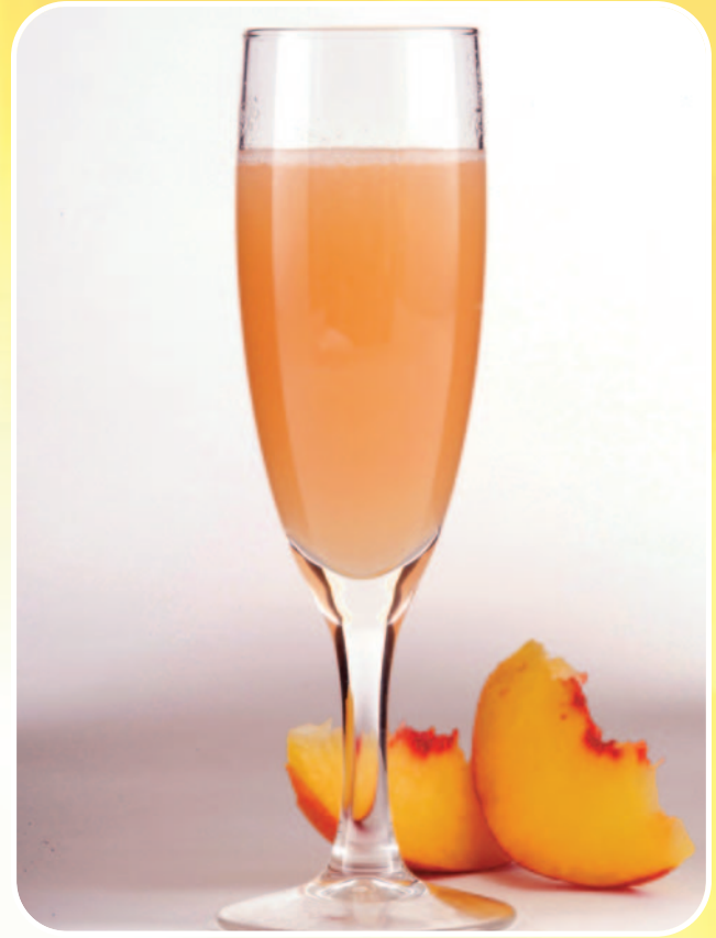
B E L L I N I