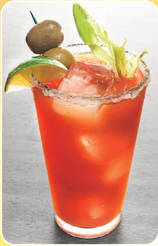
B L O O D Y M A R Y