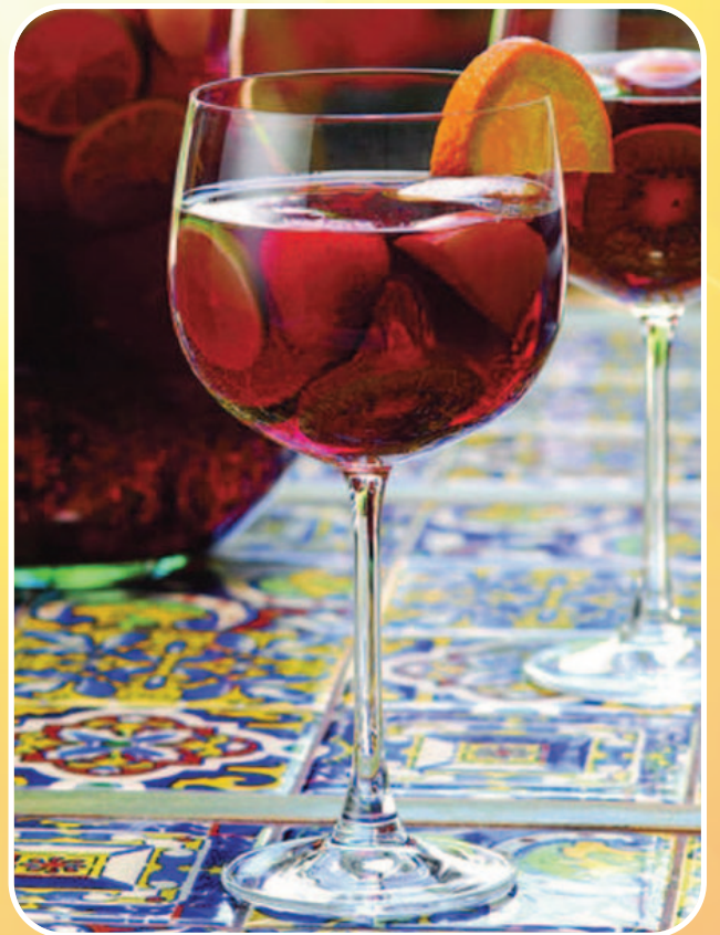
S A N G R I A