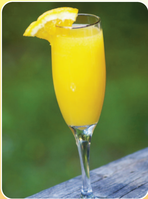
M I M O S A